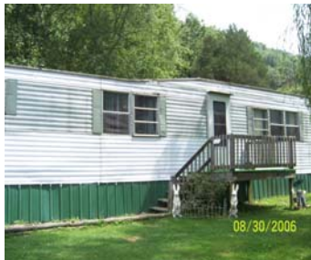
Homes before IPR.

The Home Repair program is operated in conjunction with Rural Development. Rural Development provides one-percent interest loans to low-income households, and grants to low-income individuals aged 62 and older for home repairs. Funding is provided by Rural Development and the United States Department of Agriculture.