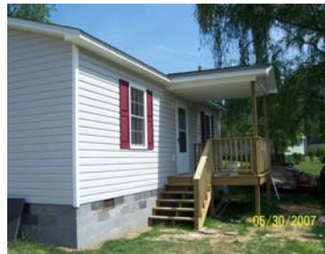
Homes after IPR.