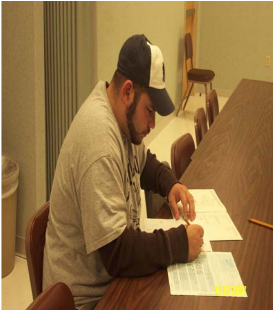
An area resident takes his WIA eligibility exam.

Workforce Investment Act (WIA) serves low-income adults who are unemployed or underemployed. The program provides job training and placement in partnership with the Virginia Employment Commission, Occupational Enterprises, Inc., Wise Skills Center, Regional Adult Education, and many other businesses in the area. The program teaches participants job skills such as reading, writing, and computer literacy. The program also teaches necessary life skills such as basic money management, social skills, and personal skills such as grooming and proper attire. Job placement is coordinated with businesses and industry leaders throughout the community. Businesses explain their needs regarding participant qualifications and RADA works to address those needs by training program participants with the skills they can apply toward that position.